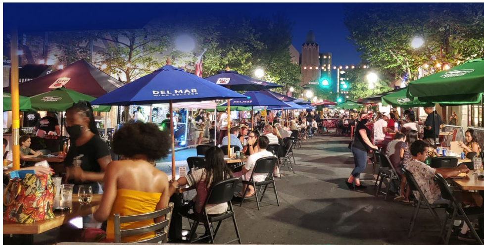
Image 2: Outdoor Dining on George Street during the Covid-19 Pandemic.

Located in the heart of downtown New Brunswick, the Bloustein School is within walking distance of numerous bars, restaurants, and entertainment venues. George Street, one of the main thoroughfares in the city, provides many options for dining and other forms of entertainment.