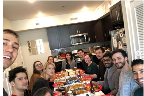
Image 1. Friendsgiving with Bloustein Friends

Outside of the classroom, Bloustein students take advantage of our close proximity to these large metropolitan areas, as well as more local destinations. We take the train for day trips to New York City, Philadelphia, or short drives to Princeton for dinner. In the warm months we head over to the Jersey Shore for a day at the beach to enjoy the sunshine and some relaxation.